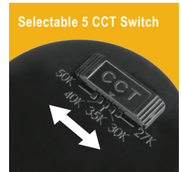
Selectable 5 CCT Switch