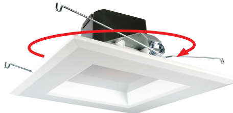
120-277V 0-10V Dimming Ver.