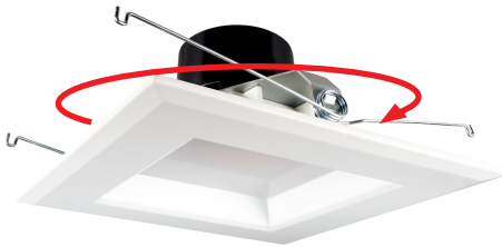
120V Triac Dimming Ver.

Use the switch to set the desired CCT (Correlated Color Temperature).